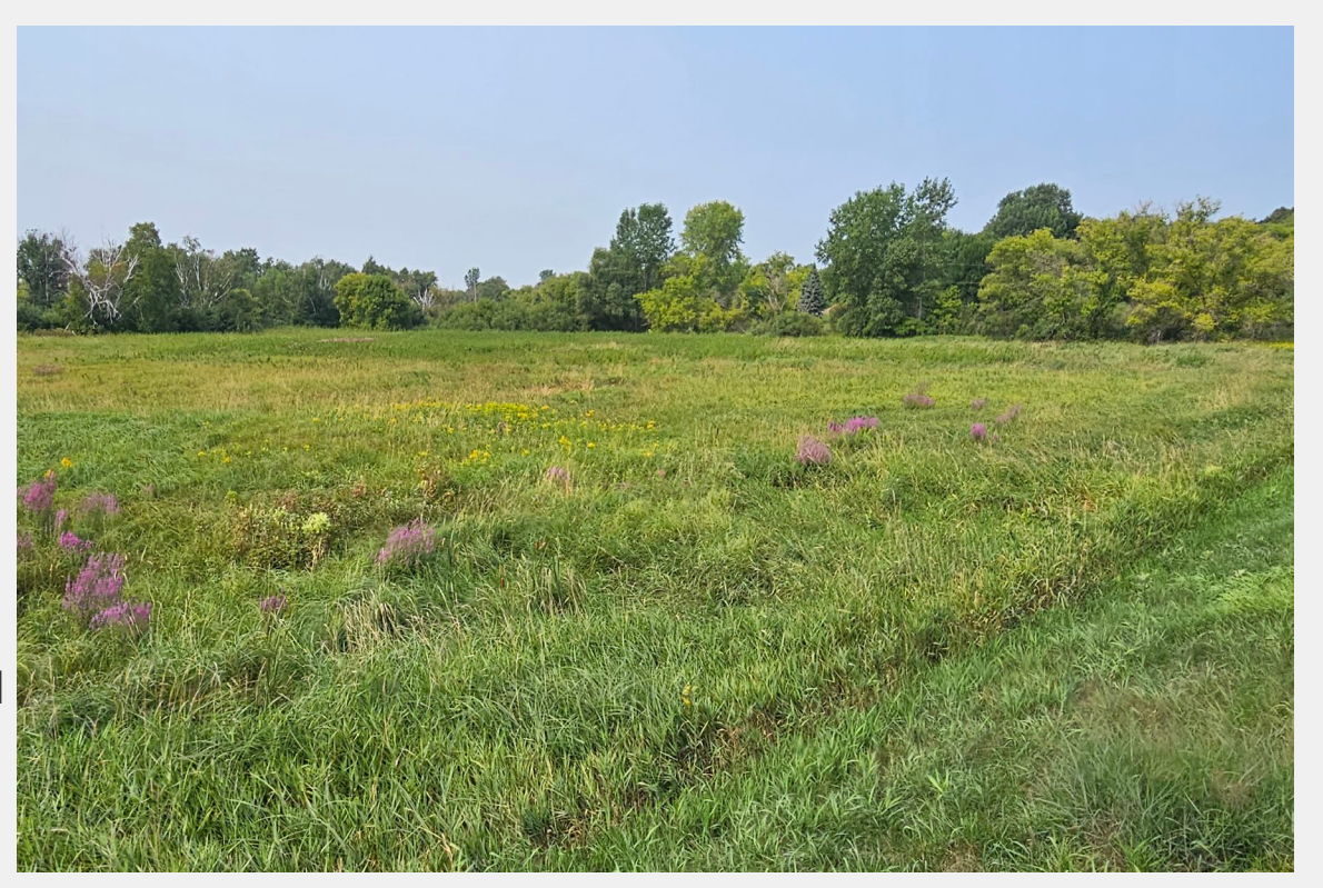
View of wetland from Hwy 97