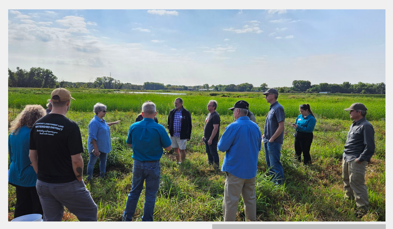
Project completion celebration 8-30-23

All project elements completed. Punchlist work complete. Waiting on closeout documents from PCO.